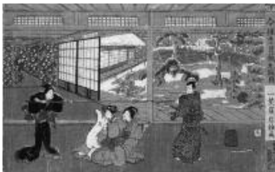
The Actor's Image: The Japan-Virginia Society Collection of Ukiyo-e Prints October 23–December 13, 2009