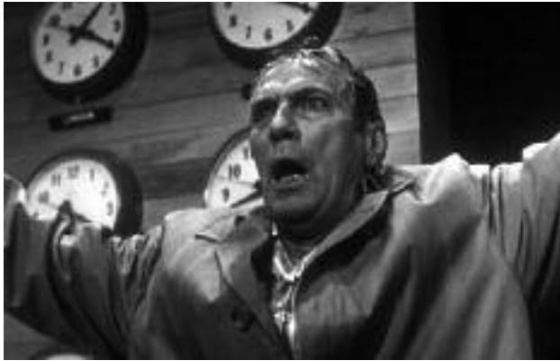
Wired Colloquium Film, Network (1976), October 6